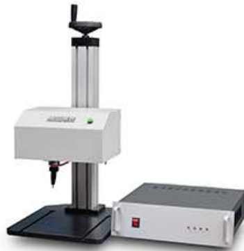
PEQD-100 Flat Marking