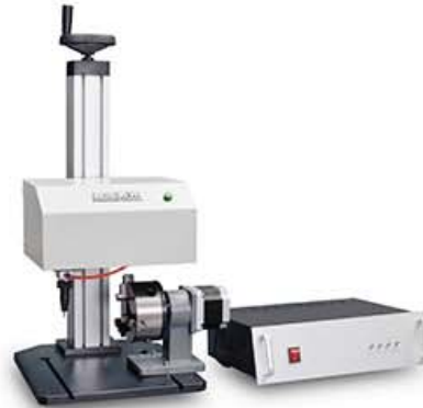
PEQD-025 Flat + Rotary Marking