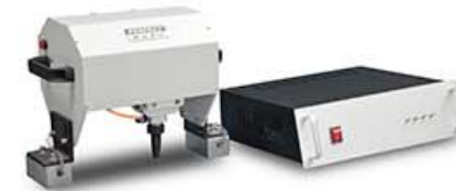
PEQD-030 Portable Type